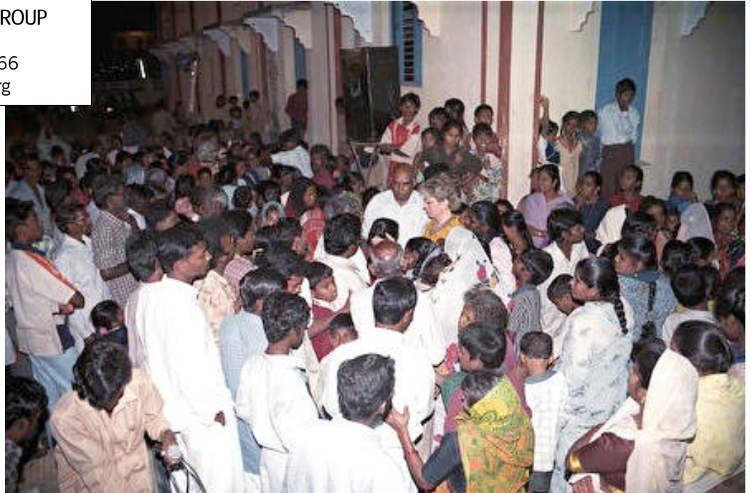
Hundreds thronged the team members as they prayed for the sick in southern India

For hundreds of years pigs and seashells were used as currency in these islands ?