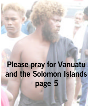
Please pray for Vanuatu and the Solomon Islands page 5

Julie and the YMG team plan to return in February 2003 for further ministry, including a pastors and women's conference, and street outreach in partnership with Operation Mobilisation.