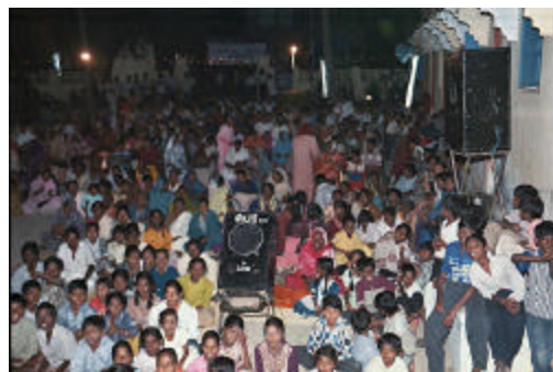
Nightly crowd at YMG Campaign, February 2002 in southern India

the Lord lifts up those who are bowed down..."